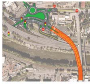
Alternative 3-A (Intersection Option A) SH 82 separated from 6th Street + Roundabout for local traffic at 6th/Laurel