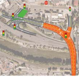
Alternative 3-D (Intersection Option D) SH 82 separated from 6th Street + "T" intersection to 6th/Pine for local access