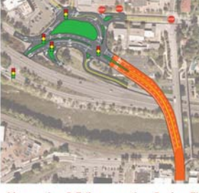
Alternative 3-E (Intersection Option E) SH 82 separated from 6th Street + Local access intersection to 6th Street

The Stakeholder Working Group attendees were asked to discuss what they liked about certain considerations, and what concerns they had and why. The topics were: